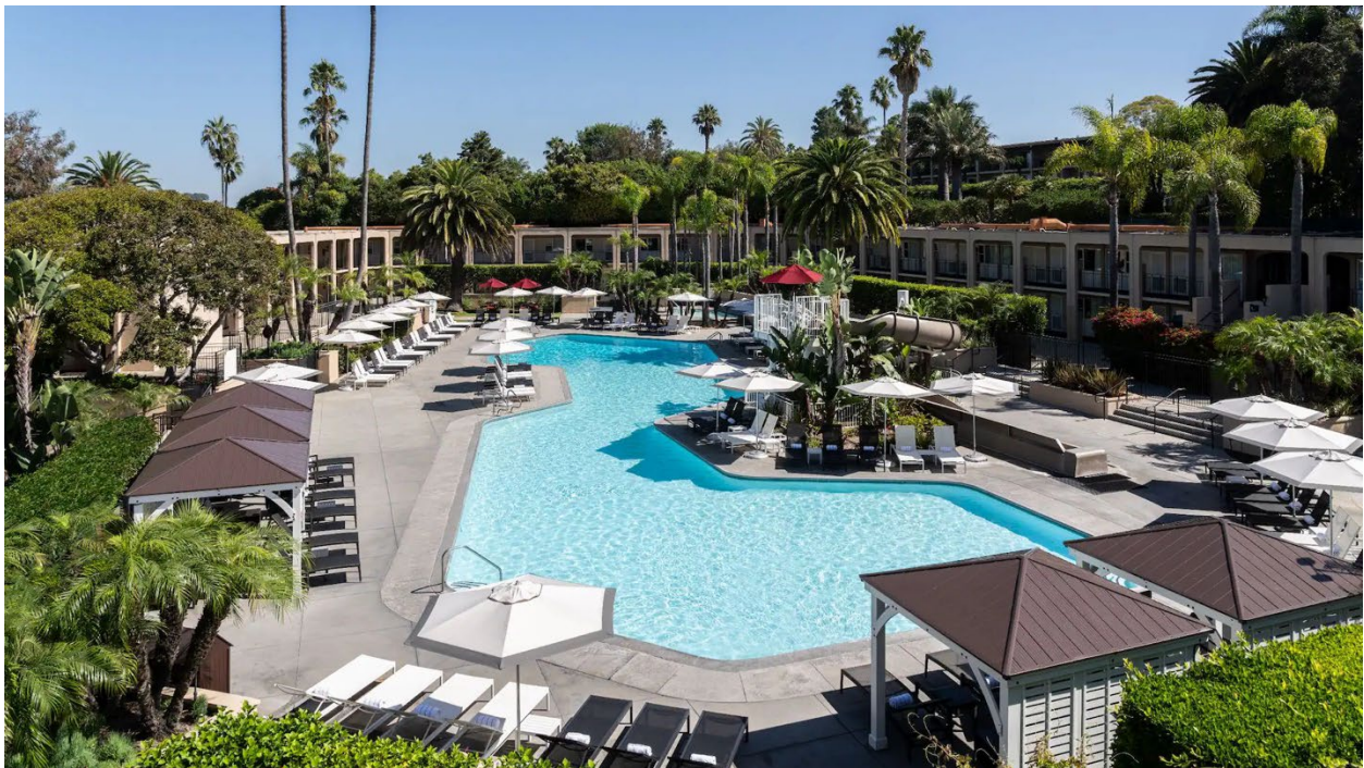
Oasis Pool at the Hyatt Regency Newport Beach

Participants are encouraged to make hotel reservations as soon as possible to access the special group rate. The Hyatt Regency will accept reservations at the special group rate on a first-come, first served basis, and all reservations must be made by February 17, 2026.