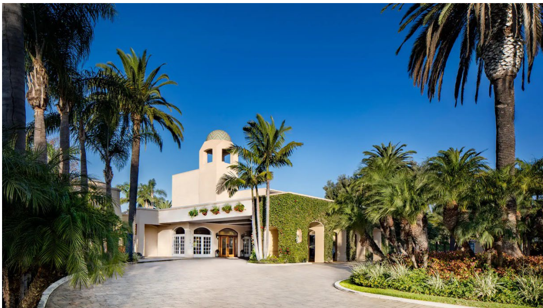
Hyatt Regency Newport Beach

Hyatt Regency Newport Beach is a resort-style hotel adjacent to the Upper Newport Bay Ecological Reserve, nestled among 26 acres featuring hundreds of palms and succulents.